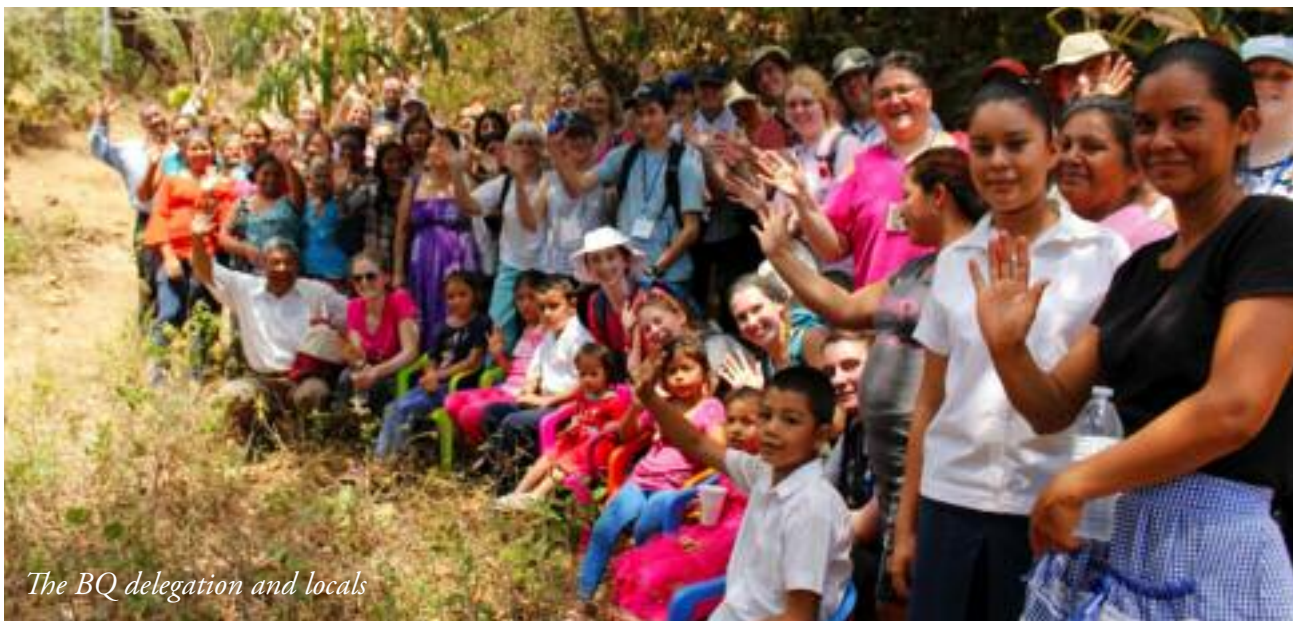
The BQ delegation and locals

While her church had already proven its commitment to IBE, this particular incident demonstrated a new level of that partnership. "It is important to remain vigilant, advocate for the oppressed and for us to stand in solidarity with them in their hopefulness that